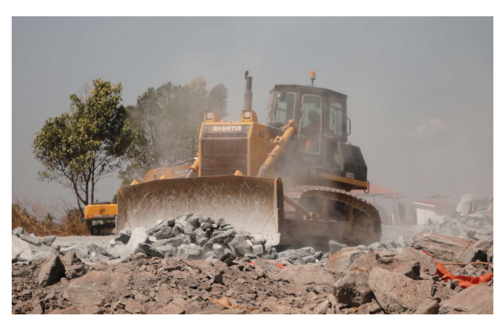
Demolition of houses in Awoo village.

34 Uganda Investment Authority, Uganda 2017