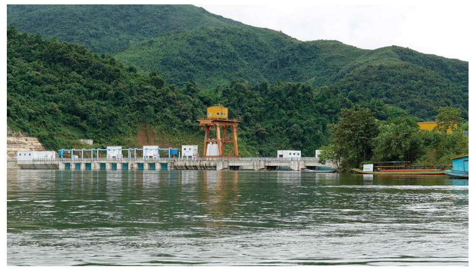
One of the Nam Ou dams.

The second project is the Nam Theun 2 hydropower station financed by the World Bank. The discussion on social and environmental impacts of this project draws on the 2018 publication Dead in the Water. 35 Our Laotian informants strongly advised against conducting our own fact finding mission to the project area.