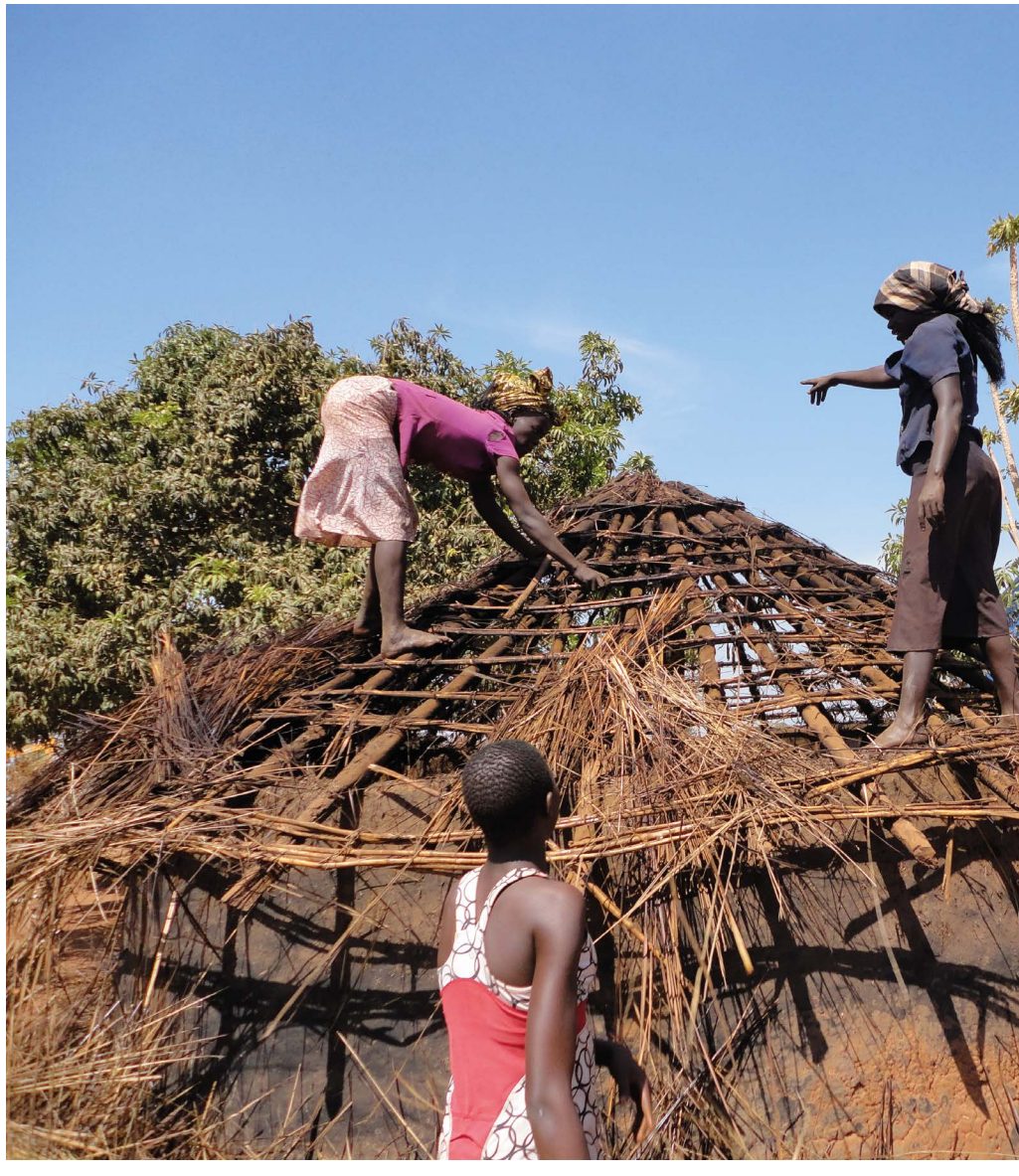
Women of Awoo Village in Karuma trying to remove some of the building materials from their huts as they are being evicted.

It was in the early 2000s that the World Bank and other IFIs resumed investments in what they call 'High Risk, High Reward' infrastructure projects. Around the same time, the World Bank started to engage corporate players in Public Private Partnerships (PPPs) for the investments in such mega-projects. The Nam Theun 2 project in Laos and Bujagali dam in Uganda can be considered pilot projects for this new approach. Public Private Partnerships have since become a much-used way to mobilise private finance for infrastructure development.