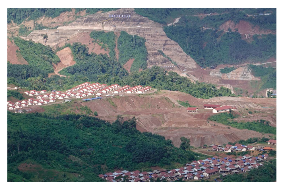
The resettlement site of one of the Nam Ou dams. In the background is the dam project location. Chinese characters in blue banners on the cliff.

riverbank garden anymore, and at the resettlement site we don't have good soil for planting vegetables or other sources of food. Moreover, our village is becoming smaller and smaller because of the landslide along the Ou River. We wonder how much will be left of our village in a few years from now!"