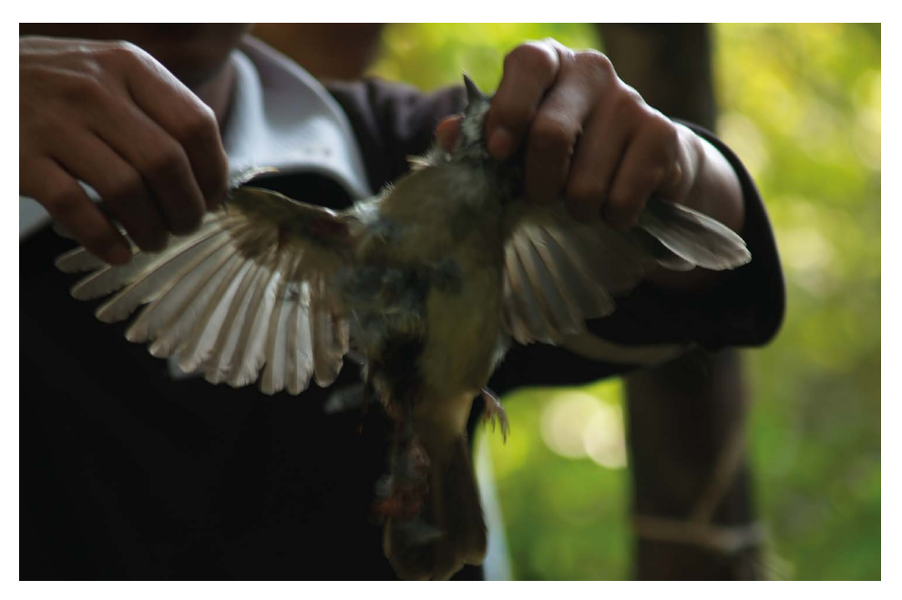
Game from the forest in Laos.

noted that resettled villagers were beginning to experience a decline in their standard of living. In late 2015, the Panel determined that livelihoods had not been sustainably restored and that the implementation period should be extended.