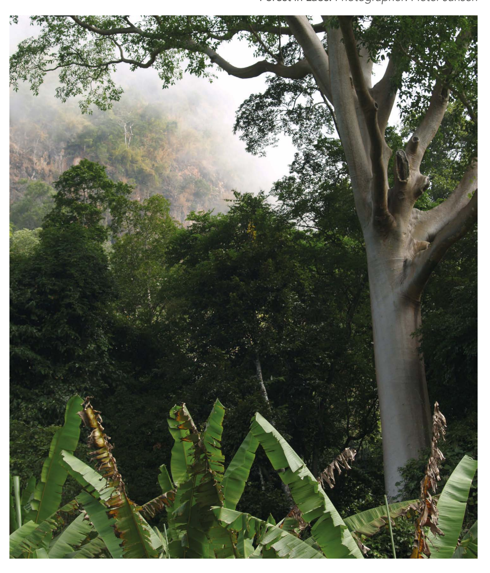
Forest in Laos.