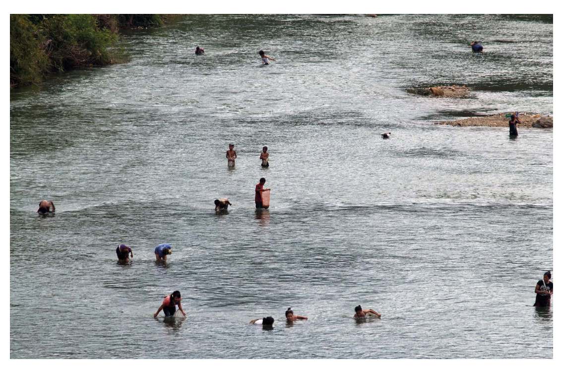
Due to projects such as the dams in the Nam Ou, communities lose control over the natural resources that they depend on for their living. This picture shows people collecting riverweed. Picture was taken before the start of the construction of a cascade of dams in the Nam Ou, Laos 2011.

The following two chapters deal with the Bujagali and Karuma hydropower projects in Uganda, and the Nam Ou and Nam Theun 2 hydropower projects in Laos. The goal is to provide insights into the resettlement effects persisting in the communities after project completion. Whether or not the impoverishment of displaced communities after project completion is being addressed, is the litmus test for how seriously poverty reduction and environmental sustainability were aimed at during the project development and funding process. The proof of the pudding is in the eating.