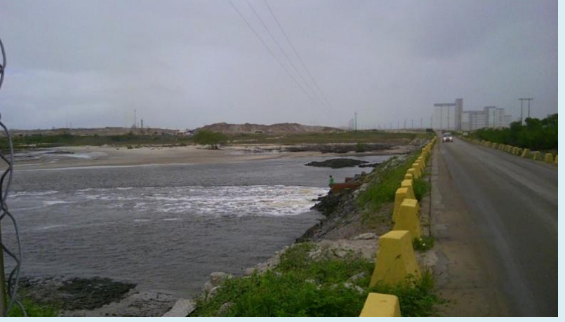
Access dam to the Estaleiro Atlântico Sul blocking the free flow of water in and out of the Tatuoca estuary, Suape harbor

Author:Wiert Wiertsema, Senior Policy AdvisorPublished:February 2013