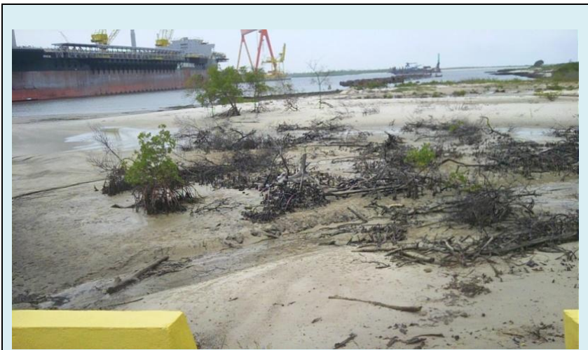
Destroyed mangroves in front of the Estaleiro Atlântico Sul on the Island of Tatuoca, Suape harbor