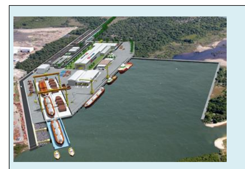
Artist impressions of Estaleiro Promar S.A. next to the Estaleiro Atlântico Sul

The project will cover a surface of 97,4 ha, of which 17 ha will be dredged for the construction of the basin of the shipyard. Some 80 ha will be used for the shipyard facilities. This will destroy an area of 45 ha of Restinga forest – a distinct type of coastal tropical and subtropical moist broadleaf forest – and mangrove forests.